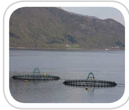
Strength combined with flexibility