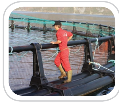
A safe and sturdy work station