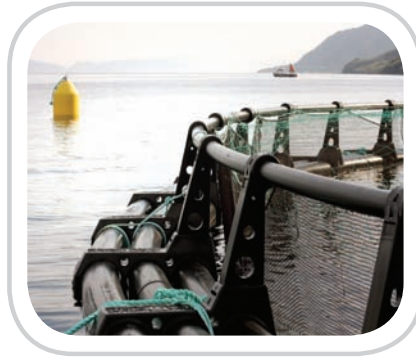
Flexible solutions and options

tel +47 55 08 30 00 tel +47 70 25 41 30 info@oceo.no www.ocea.no