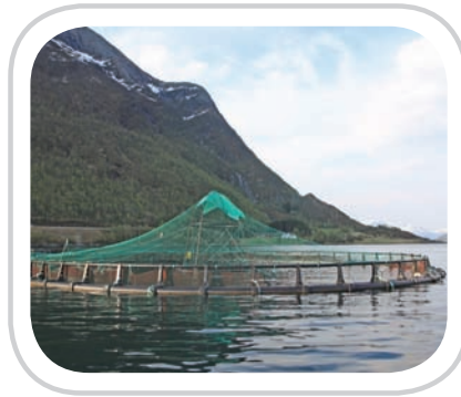
20-year design lifetime